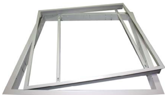
REF: VL-FRAME02 FINISHED KIT FOR VL-PRO SERIES